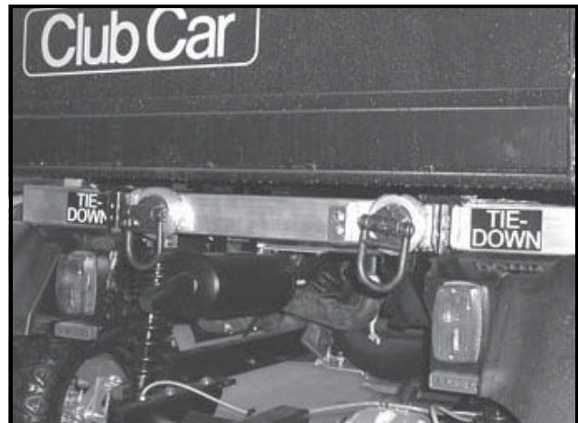
Figure 4 Rear Vehicle Tie-Downs