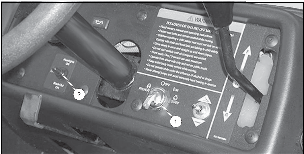
Figure 1 Instrument Panel

Turn the switch to PREHEAT position if the temperature falls below 23°F (-5°C). Do not hold the switch in the PREHEAT position longer than 20 seconds.